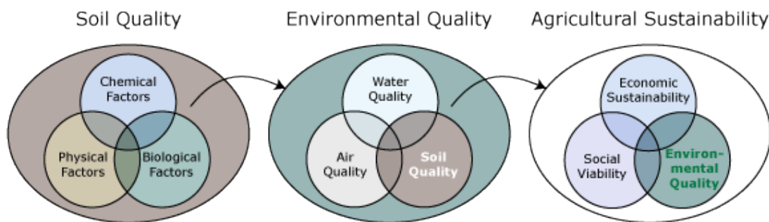
Figure 2. Ecosystem sustainability (Source: [27])

These domains overlap where agroecological, social, and economic processes interact (e.g., in determining the vulnerability of ecosystems to management strategies and the impacts of land degradation). Solid arrows represent links between factors that determine vulnerability and land degradation, dashed arrows represent potential links between vulnerability and land degradation (Source:[26]).